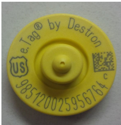
15-digit 985 series tag

Animals with breed association or manufacturer tags applied after this date will have their health papers rejected at NY Fairs and Shows.