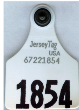
Breed Association tag