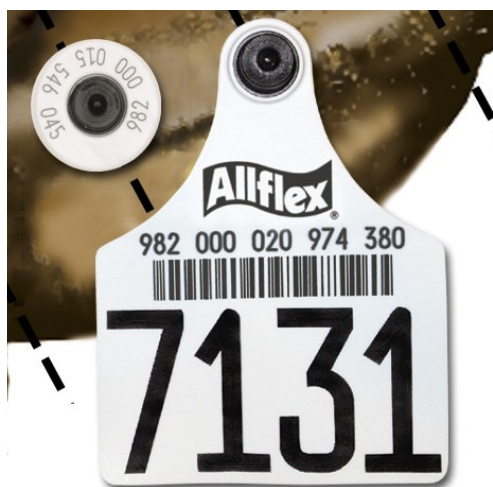
15-digit 982 series tag