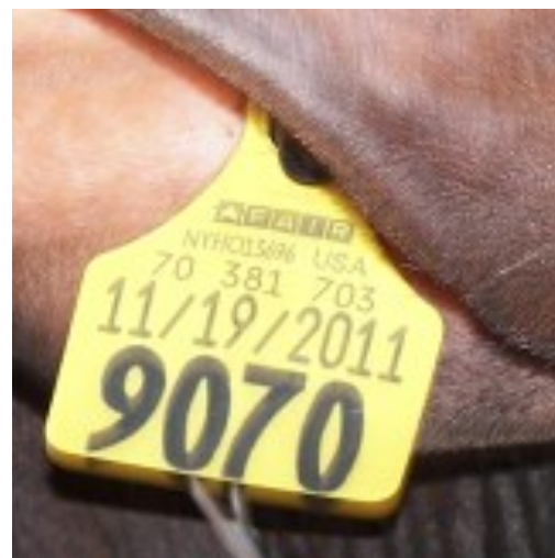
FAIR, NYHO tag